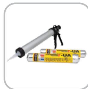
20 oz. Sausage