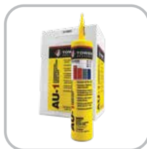
10.1 oz. Cartridge