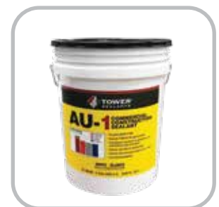
2 gal. Pail or 5 gal. Pail