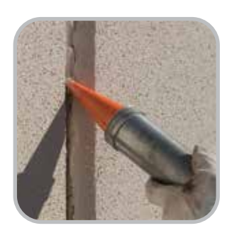
Perfect for Window & Door installation and a wide variety of Commercial Construction applications.

For product information or samples call: 866.897.7568 For tech support email: tech@towersealants.com Online at: www.towersealants.com