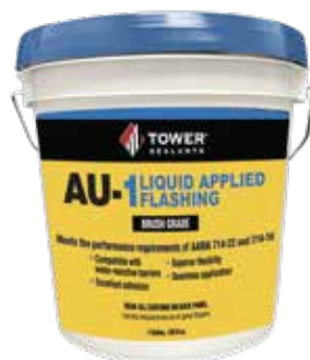
1 Gallon TS-00461