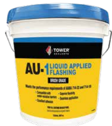
5 Gallon TS-00462